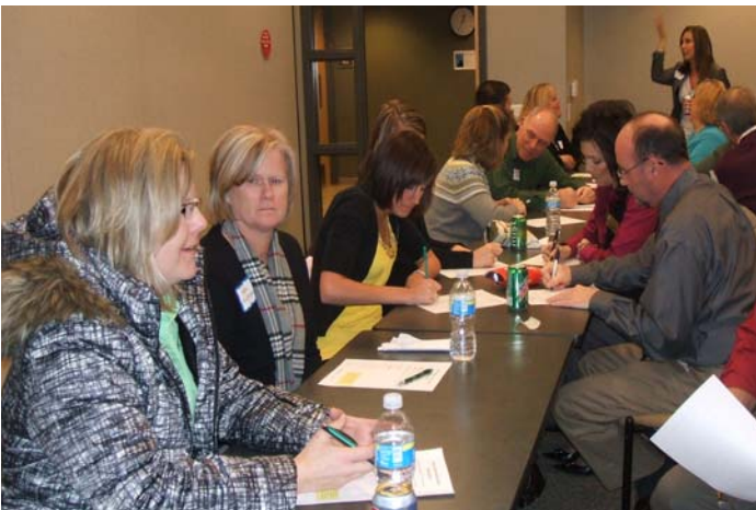
Chamber members work on skills to help in remembering names, the topic for the January Power Lunch.