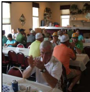
Dinner followed at Del's Pub & Grill in Eldridge